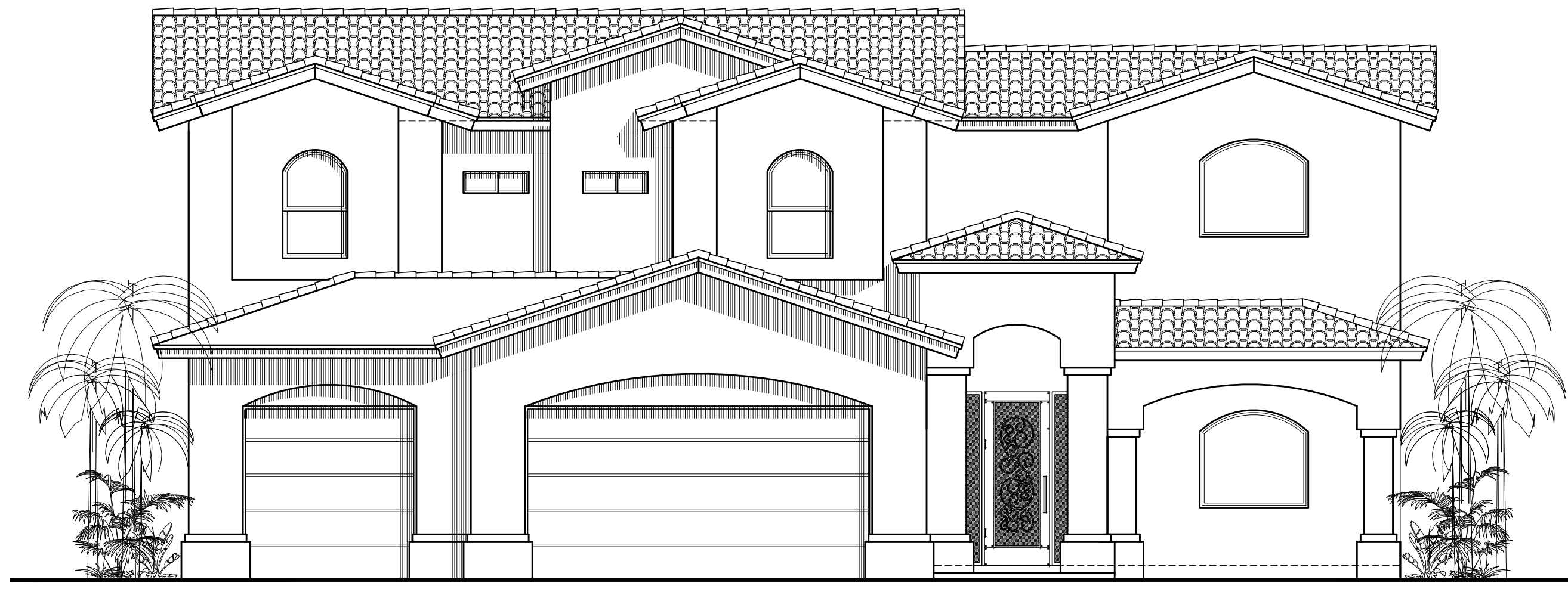
PROPOSED FRONT ELEVATION-4

1ST FLOOR - 2282 S.F 2ND FLOOR - 1980 S.F TOTAL AREA - 4262 S.F